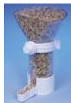
Funnel Seed Feeder