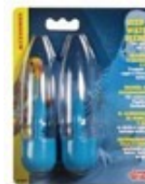
Vertical Feeder and Waterer