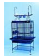
Medina Playtop Bird Cage

Attention Webmasters: Publishing of this document without express written authorization of Cheap Pet Store, Inc. is deemed unlawful.