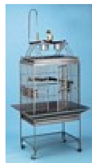
Chiquita Play Top Cage