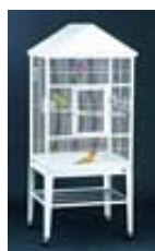
Loro White Bird Cage