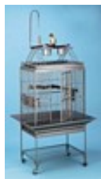
Chiquita Playtop Bird Cage