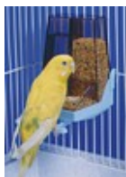
Automatic Twin Feeder/Waterer