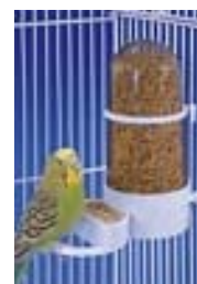
Jumbo Fountain Feeder