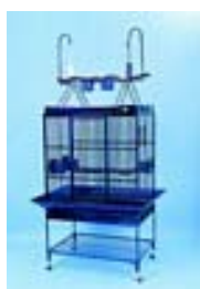
Medina Playtop Bird Cage