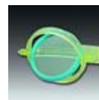
Double Axis Bird Toy