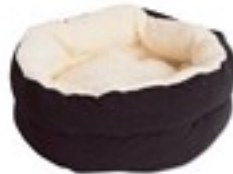
Plush Kitty Nest