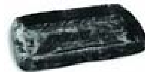
Carrier Pet Bed

When your pet climbs the hill into his senior years his needs will change again. Dietary changes are the most prevalent at this life stage. As your cat ages, so does his digestive system. Make sure your Senior Egyptian Mau maintains a proper diet and receives proper nutrients by starting him on a daily vitamin. Senior cats also need to have their weight monitored. They are more susceptible to weight gain because, like humans, their metabolism slows down as they age. Some senior cats may also experience weight loss due to loss of appetite so any change in weight should be closely monitored and brought to the attention of your vet. Keep abreast of the latest trends in dental products. There are many tartar control products on the market today. Tartar build up can lead to gum disease in older cats. Eye discoloration is normal in elderly cats. It is usually nothing to be concerned about and will not interfere with their vision. Just remember that cats age in some of the same