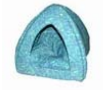
Kitty Pyramid Bed