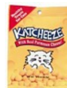
Katcheeze Cat Treats