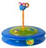
Cheese Chase Multi-Activity Cat Toy