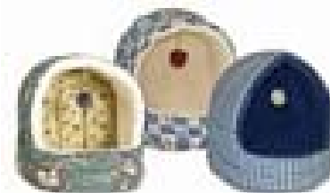
Basic Kitty Cradle

It can be a matter of personal preference to adopt or rescue an Egyptian Mau. Another option would be to select your Egyptian Mau from a reputable breeder.