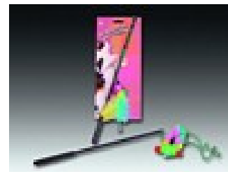
Wanderfuls Cat Toy