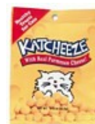
Katcheeze Cat Treats