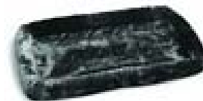
Carrier Pet Bed

You'll need these basics before your European Burmese comes home. Click the items below to go to CheapPetStore.com to find the best prices for online pet supplies.