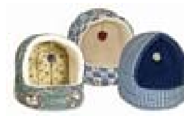
Basic Kitty Cradle

It can be a matter of personal preference to adopt or rescue a European Burmese. Another option would be to select your European Burmese from a reputable breeder.