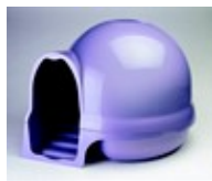
Booda Dome Clean Step Litter Box