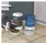
Le Bistro Automatic Feeder