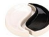
Yin Yang Design Cat Dish

When your pet climbs the hill into his senior years his needs will change again. Dietary changes are the most prevalent at this life stage. As your cat ages, so does his digestive system. Make sure your Senior European Burmese maintains a proper diet and receives proper nutrients by starting him on a daily vitamin. Senior cats also need to have their weight monitored. They are more susceptible to weight gain because, like humans, their metabolism slows down as they age. Some senior cats may also experience weight loss due to loss of appetite so any change in weight should be closely monitored and brought to the attention of your vet. Keep abreast of the latest trends in dental products. There are many tartar control products on the market today. Tartar build up can lead to gum disease in older cats. Eye discoloration is normal in elderly cats. It is usually nothing to be concerned about and will not interfere with their vision. Just remember that cats age in some of the same ways that humans do. You can help them manage aches and pains with the proper pet healthcare aids, knowledge, and care.