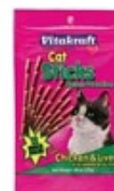
Cat Sticks - Chicken/Liver