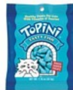
Trout Topini Treats