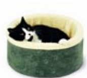
Cat-N-Round Cat Bed