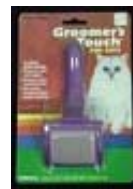
Groomers Touch Slickers Wire Brush for Cats

Attention Webmasters: Publishing of this document without express written authorization of Cheap Pet Store, Inc. is deemed unlawful.