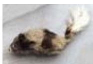
A-Door-Able Real Fur Mouse