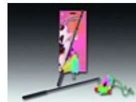
Wanderfuls Cat Toy