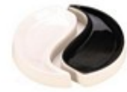
Yin Yang Design Cat Dish

Japanese Bobtail's are a generally a healthy breed and have no specific health concerns that are inherent to their breed. However, it is a good idea to have the kidneys, liver and teeth checked on a regular basis after about 8 or 9 years of age