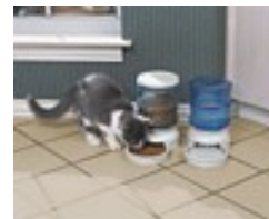
Automatic Feeder and Waterer