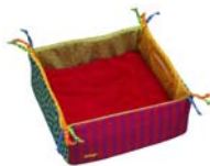
Snug Spot Bed