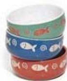
Debossed Cat Dish