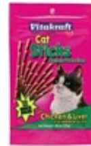
Cat Sticks - Chicken/Liver