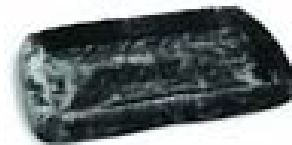
Carrier Pet Bed

When your pet climbs the hill into his senior years his needs will change again. Dietary changes are the most prevalent at this life stage. As your cat ages, so does his digestive system. Make sure your Senior Japanese Bobtail maintains a proper diet and receives proper nutrients by starting him on a daily vitamin. Senior cats also need to have their weight monitored. They are