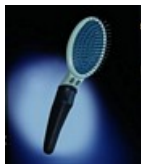
Cat Pin Brush