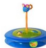
Cheese Chase Multi-Activity Cat Toy