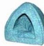
Kitty Pyramid Bed

Every year, thousands of animals are either captured or turned in by their owners to be adopted. These pets can make wonderful companions and desire a loving home to call their own. When considering adoption, you should choose an animal shelter or rescue in your nearby community that you trust and one that has a long-standing reputation for providing exceptional care to the animals. Shelters that have an on-site vet clinic are a plus. Many facilities will require the pet to be spayed or neutered before the adoption is complete. This fee will be included in the adoption costs.