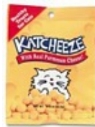
Katcheeze Cat Treats