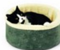
Cat-N-Round Cat Bed