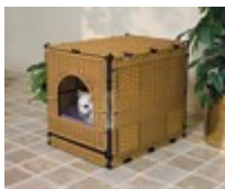
Bay Isle Hide-a-Way