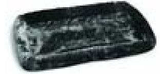
Carrier Pet Bed