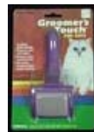
Groomers Touch Slickers Wire Brush for Cats

Attention Webmasters: Publishing of this document without express written authorization of Cheap Pet Store, Inc. is deemed unlawful.