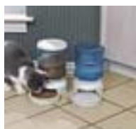
Le Bistro Automatic Feeder