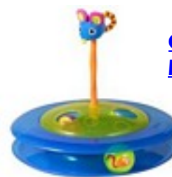
Cheese Chase Multi-Activity Cat Toy