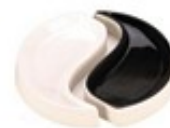
Yin Yang Design Cat Dish

As a breed, Siberians are healthy, hardy cats. The Siberian is a very hardy and does not have any known genetic abnormalities or diseases. Although it hasn't been scientifically proven, many will tell you that they were allergic to cats until they owned a Siberian. Many who have been allergic their whole lives to cats can be around Siberians all day and not have any allergic reactions. Welcome to the world of the Siberian. You should have many happy, healthy years with your Siberian!