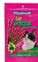
Cat Sticks - Chicken/Liver