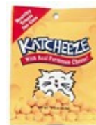
Katcheeze Cat Treats