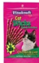
Cat Sticks - Chicken/Liver