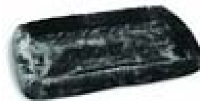
Carrier Pet Bed

When your pet climbs the hill into his senior years his needs will change again. Dietary changes are the most prevalent at this life stage. As your cat ages, so does his digestive system. Make sure your senior Siberian maintains a proper diet and receives proper nutrients by starting him on a daily vitamin. Keep abreast of the latest trends in dental products. There are many tartar control products on the market today. There are bones, toys, and toothbrushes essential to an older cats' health and happiness. Just remember that cats age in some of the same ways that humans do. You can help them manage aches and pains with the proper pet healthcare aids, knowledge, and care.