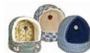
Basic Kitty Cradle