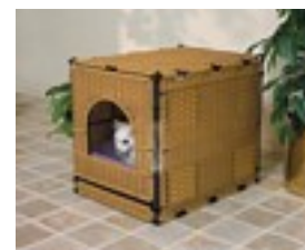
Bay Isle Hideaway

Blank Cards Cat Kitty Hoots Spiral Note Pad Magnetic Note Pad Cat Mini Cards Danica Mugs