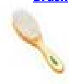
Cat Bristle Brush