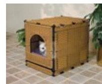
Bay Isle Hide-a-Way