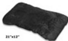
Deluxe Pet Bed