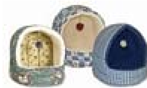
Basic Kitty Cradle

Because Sphynx cats are much like fully-furred cats and a particular effort has been made to produce sturdy, healthy cats, they are not prone to many cat ills. Of course, be sure to have your cat examined by a veterinarian regularly, but there are few general medical concerns with Sphynxes.