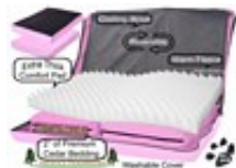
Deluxe Cat Bed