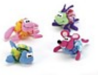
Crinkly Pom Pom Pals with Catnip