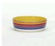
Rainbow Cat Dish