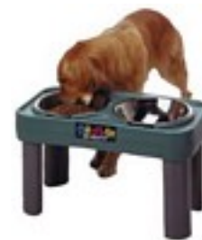
Elevated Dog Bowls

With older Airedale Terriers, look for proper coloring and markings, a well-kept coat, and good dental hygiene. Talk with the previous owner or guardian about the current diet and any behavioral issues or past injuries that you should be made aware of. If your Airedale Terrier has had a history of neglect or abuse, you will want to know this so that you are sensitive in your discipline and responses.