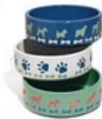
Ceramic Dog Bowls