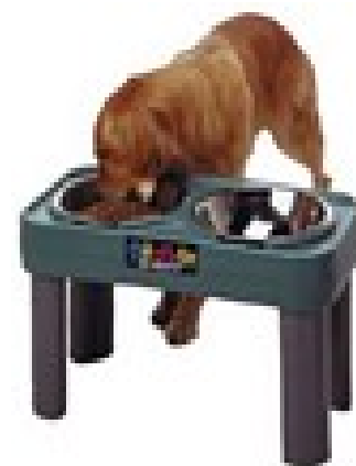
Elevated Dog Bowls

It is important to always be observant and attentive to the changing needs of your pet.