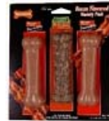
Bacon Variety Pack