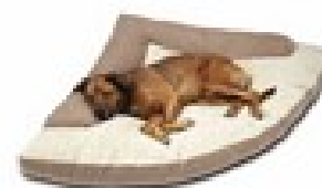
Corner Bed W/Bolster

Items to suit your senior Australian Cattle Dog: