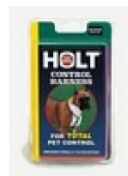
Large Holt Harness