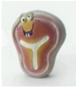
Goggles Reddish T-Bone Steak Dog Toy