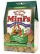
Baked Apple Mini Biscuits

Can't miss gifts for the Bichon Frise Dog owner: