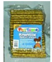
Chicken Sticks (100Pk)