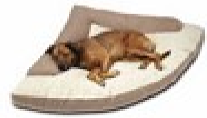
Corner Bed W/Bolster

Items to suit your senior Bichon Frise Dog: