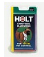
Large Holt Harness