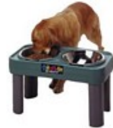
Elevated Dog Bowls

Choosing a dog can be a difficult decision because there are many different personalities and aesthetic qualities you may want to look for. Do you prefer to have the runt of the litter or the huskiest brute? Or, would you prefer a kiss of white sugar on the tips of your pup paws, or are you keener on a specific color combination? Sometimes you can make a decision based on the adorable facial expressions a pup makes. Can you resist those sweet puppy dog eyes that pierce right through to clench hold of your heart? Pet