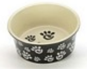
Ceramic Dog Dish