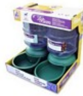
LeBistro Automatic Feeder/Waterer Combo