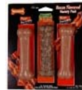
Bacon Variety Pack