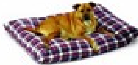
Plush Dog Bed