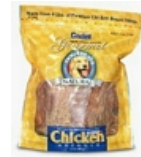
Natural Dog Treats