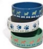
Ceramic Dog Bowls