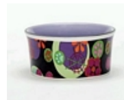
8" Ceramic Dog Dish - Geo Print