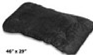
Deluxe Pet Bed