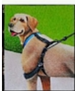
Nylon Adjustable Dog Collar