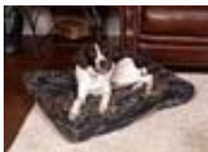
Mossy Oak Gusted Pet Bed