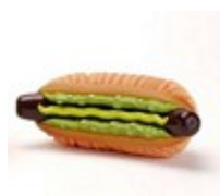
Double Deuce Bone w/ Balls Dog Toy