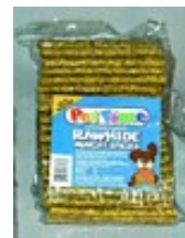
Stainless Steel No Tip Dog Bowl