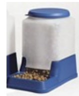
Automatic Self Feeder

Due to their small squarish stature and specific breeding, pugs are generally prone to hip, leg and joint problems. As they age, they may suffer from hip dysplasia and other leg problems. Pugs may also have a tendency to snore because of the way their head, nose, and mouth are structured. They will also snort and snuffle quite a bit, which can lead to swallowing extra air and passing gas. Pugs have a tendency to overheat, so they are not able to withstand summer heat very well and need to be inside for at least part of the time if the days are hot.