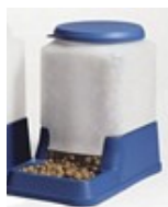
Adjustable Height Double Diner Dog Dish