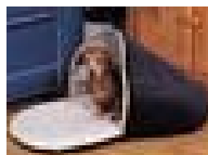
Slipper Pet Bed