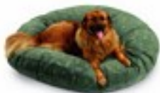
Supersoft Round Dog Bed

Some Shih Tzu breeds are prone to certain ear, eye, and respiratory problems. Back problems, specifically spinal disc disease, are also a concern for the breed.