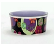
Geo Print Ceramic Dog Dish