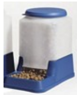
Automatic Self Feeder