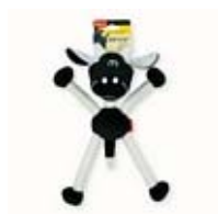
Bend N Tug Plush Dog Toy