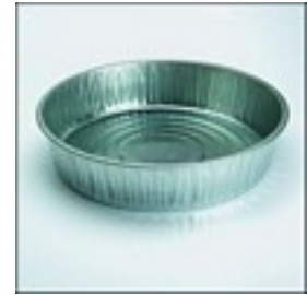
Galvanized Feed Pan

Buying a turkey from an auction or auction house is a practice that is looked down upon by many people. Auction houses do not require animals to be tested; therefore, there may be chances that you could be taking home turkeys that have are diseased. By the time the signs show up, the rest of your flock could have been infected already. Auction houses are not recommended places to buy an animal, even though it is usually the cheapest.