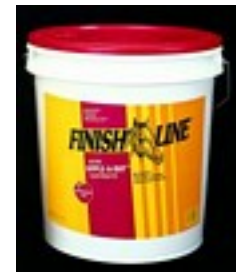
Apple A Day Electrolyte