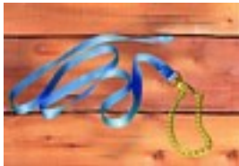
Nylon Lead W/Chain