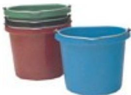
Econo Flat Back Bucket