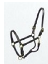
Leather Horse Halter