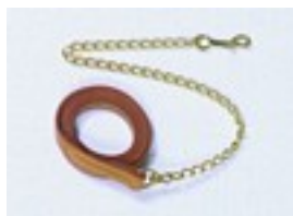
Deluxe Leather Lead