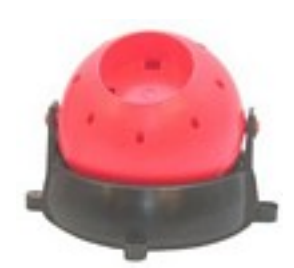
Tongue Twister Toy