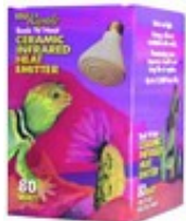
Infrared Heat Emitter