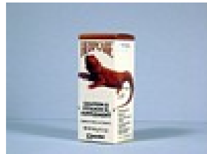
Calcium & Vitamin D Supplement