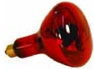
Infra Red Light