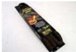
Exo-Terra Bendable Vine