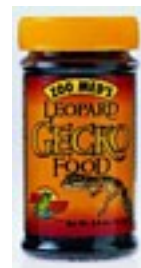
Leopard Gecko Food