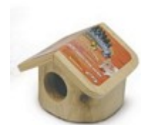
Nature's Nooks House